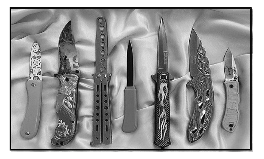
Warzone Distro WARZONEDISTRO.NOBLOGS.ORG 2018