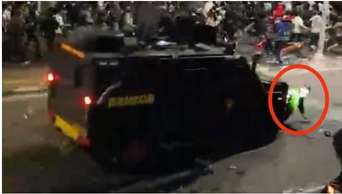
21-year-old delivery rider Affan Kurniawan killed during a student protest in Jakarta, Indonesia on Thursday (Aug 28) night.