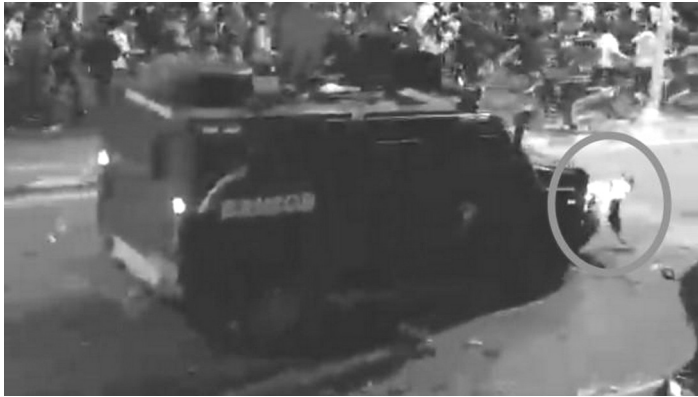
21-year-old delivery rider Affan Kurniawan killed during a student protest in Jakarta, Indonesia on Thursday night (Aug 28) .